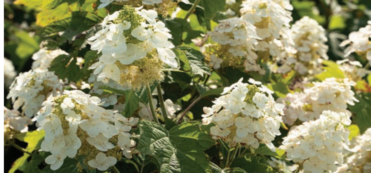
Fig 2: Blooms of Autumn Reprise™ Hydrangea.