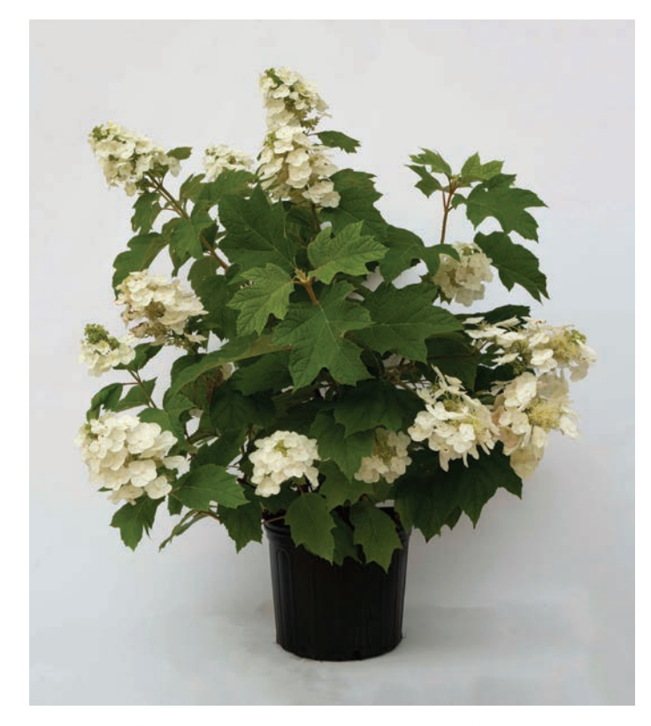
Fig 4: Finished container of Autumn Reprise™ Hydrangea.