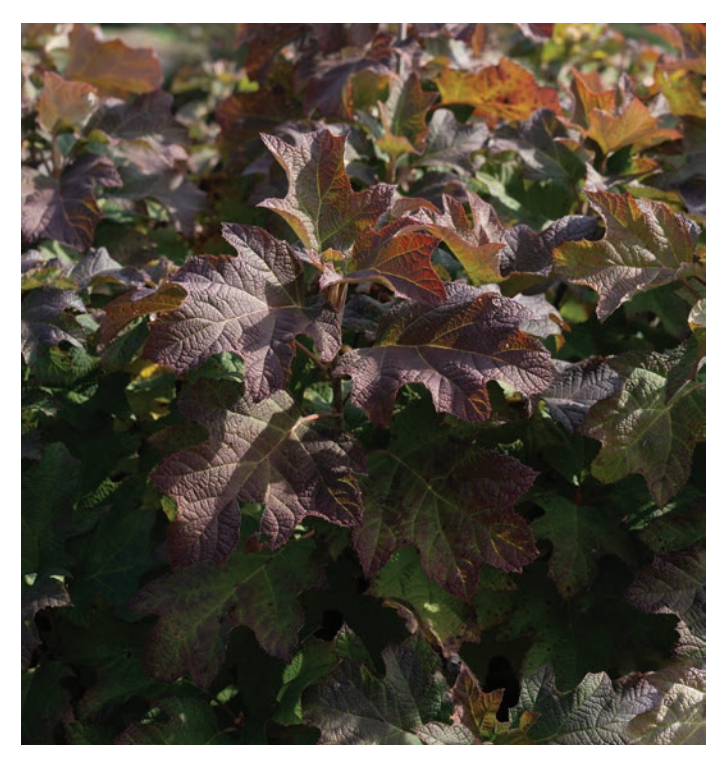
Fig 3: Fall foliage of Autumn Reprise™ Hydrangea.

• Transplant bareroot in Feb-March, saleable in June-July